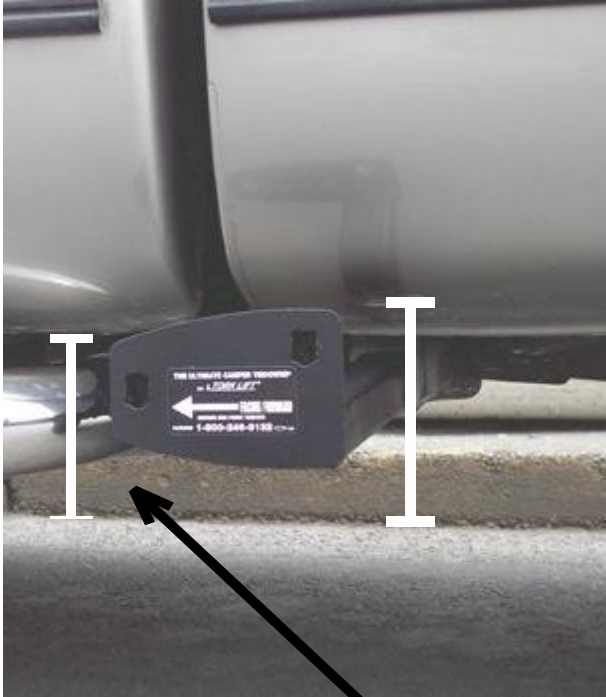
DRIVERS SIDE FRONT