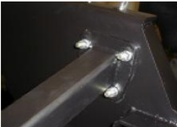
OUTSIDE VIEW "B"