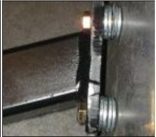
FORWARD MOST BOLT

WHEN USING THIS REAR TIEDOWN PART R3500 WITH THE TORKLIFT SUPERHITCH PART D1102 , YOU MAY FIND IT NECESSARY TO SHIM THE TWO FORWARD MOST BOLTS ON THE TIEDOWN SO THAT IT DOES NOT INTERFERE WITH YOUR EXHAUST TAILPIPE.